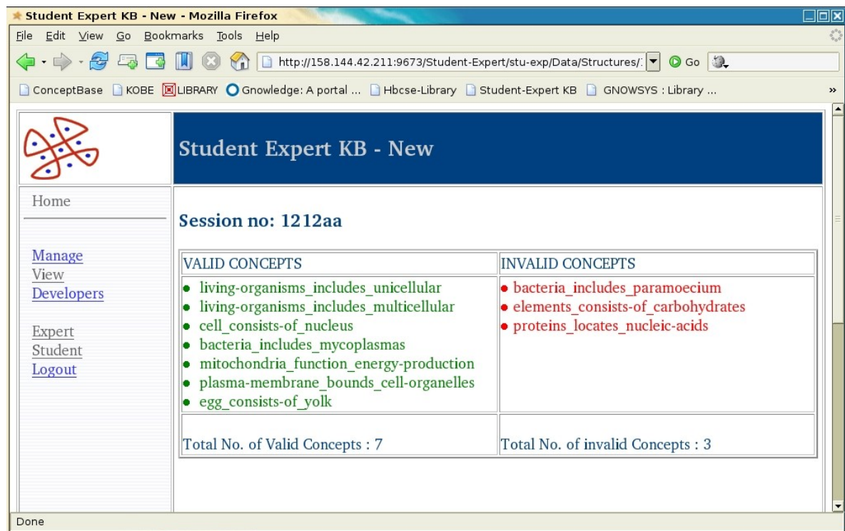
Figure 4: Screenshot showing a session being validated based on expert's knowledge base.